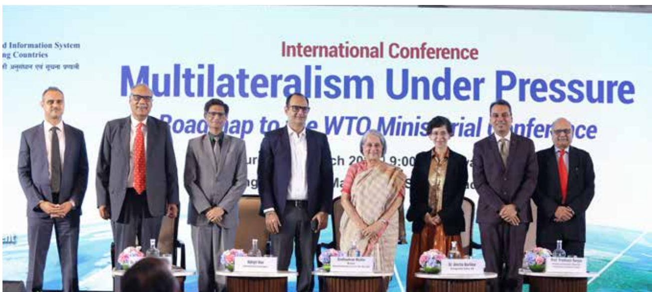
Session III: Negotiations Strategies at the WTO: Lessons from the Past at conference on ‘Multilateralism Under Pressure - Roadmap to the WTO Ministerial Conference’ on 21st March 2026 at Taj Mahal, New Delhi.