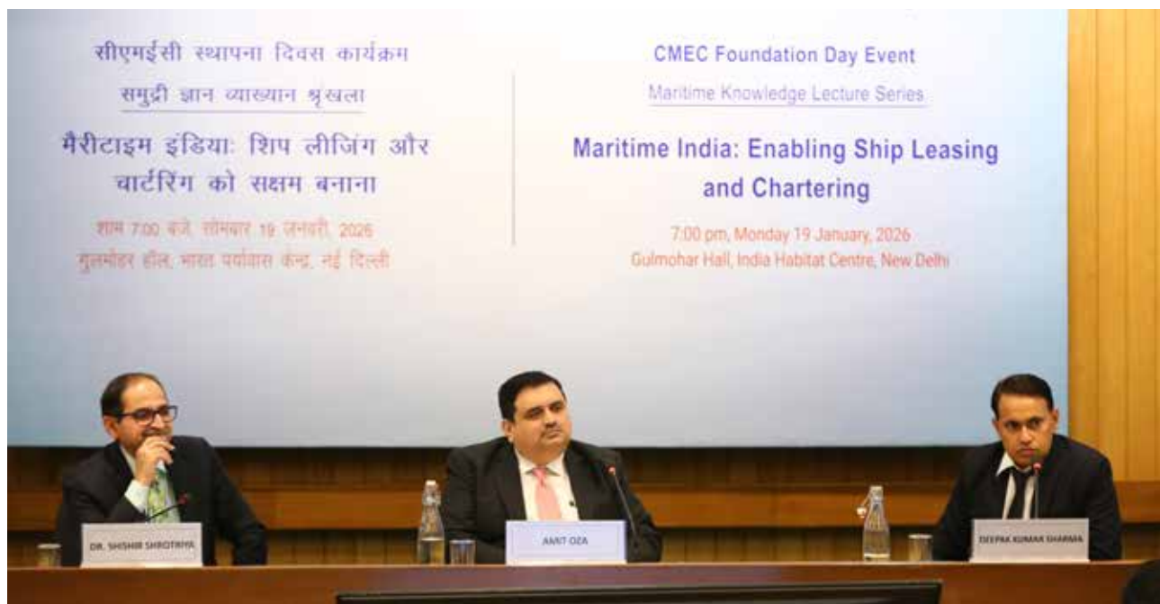
The Maritime Knowledge Lecture Series on “Enabling Ship Leasing and Chartering” in progress, fostering dialogue on maritime financing and regulatory frameworks.

CMEC at RIS, hosted the Maritime Knowledge Lecture Series on “Maritime India – Enabling Ship Leasing and Chartering” on 19 January 2026. The lecture, organised as part of the Maritime India Vision 2030 and Maritime Amrit Kaal Vision 2047 initiatives, highlighted the strategic importance of ship leasing and chartering for India’s maritime sovereignty, foreign exchange management, and economic resilience.