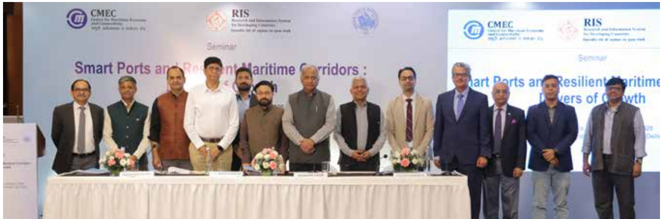
CMEC at RIS and IPA jointly hosted a seminar on “Smart Ports and Resilient Maritime Corridors: Drivers of Growth”.

Research and Information System for Developing Countries through its Centre for Maritime Economy & Connectivity (CMEC), jointly with Indian Ports Association, organised a seminar titled “Smart Ports and Resilient Maritime Corridors: Drivers of Growth” on 23 March 2026. The seminar examined the slow adoption of digital and emerging technologies in India’s maritime sector despite the availability of operational data and digital platforms such as e-Bill of Lading and MAITRI Virtual Trade Corridors. Discussions focused on resilient maritime corridors, green ports, and digital ports and corridors as critical drivers of India’s future trade competitiveness.