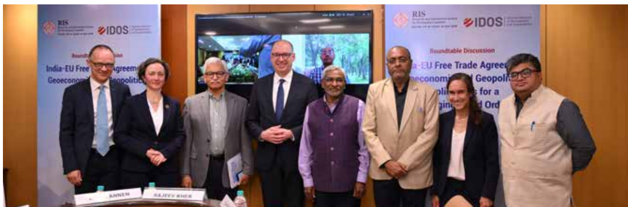
RIS and IDOS hosted Roundtable Discussion 'India-EU Free Trade Agreement: Geoeconomic and Geopolitical Implications for a Changing World Order'.