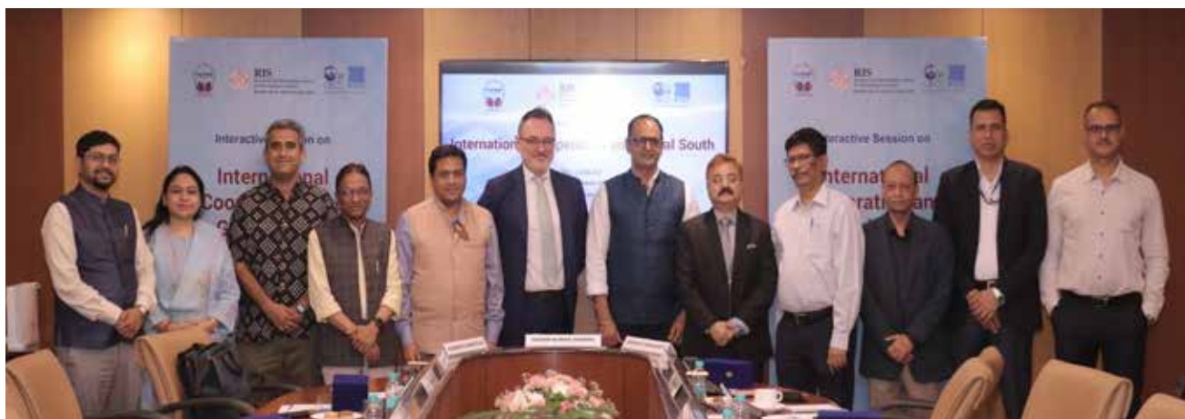
RIS and OECD (Development Centre) hosted an interactive session on 'International Cooperation and the Global South'

Research and Information System for Developing Countries and DAKSHIN - Global South Centre of Excellence, in partnership with OECD Development Centre, organised an interactive session on "International Cooperation and the Global South" on 12 March 2026. The session brought together policymakers, researchers, and development practitioners to deliberate on emerging approaches to international cooperation and pathways towards a fair, equitable,