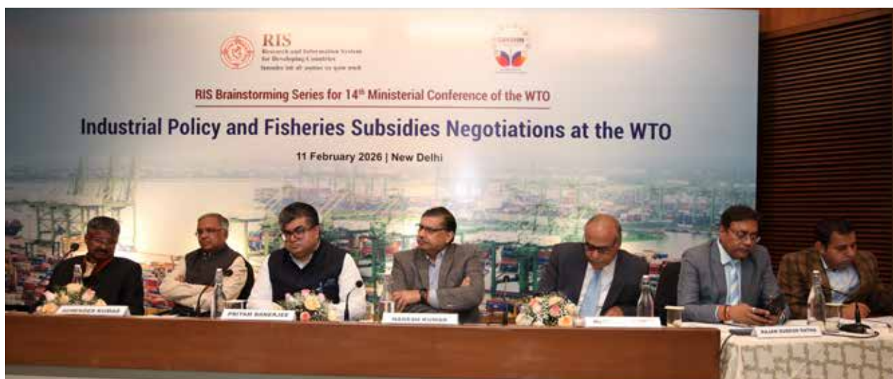
RIS Brainstorming Series for MC14, WTO: Dialogue on Industrial Policy.

As part of its Brainstorming Series ahead of the 14th WTO Ministerial Conference (MC14), Research and Information System for Developing Countries organised discussions on ‘Industrial Policy’ and ‘WTO Negotiations on Additional Provisions on Fisheries Subsidies,’ on 11th Feb 2026.