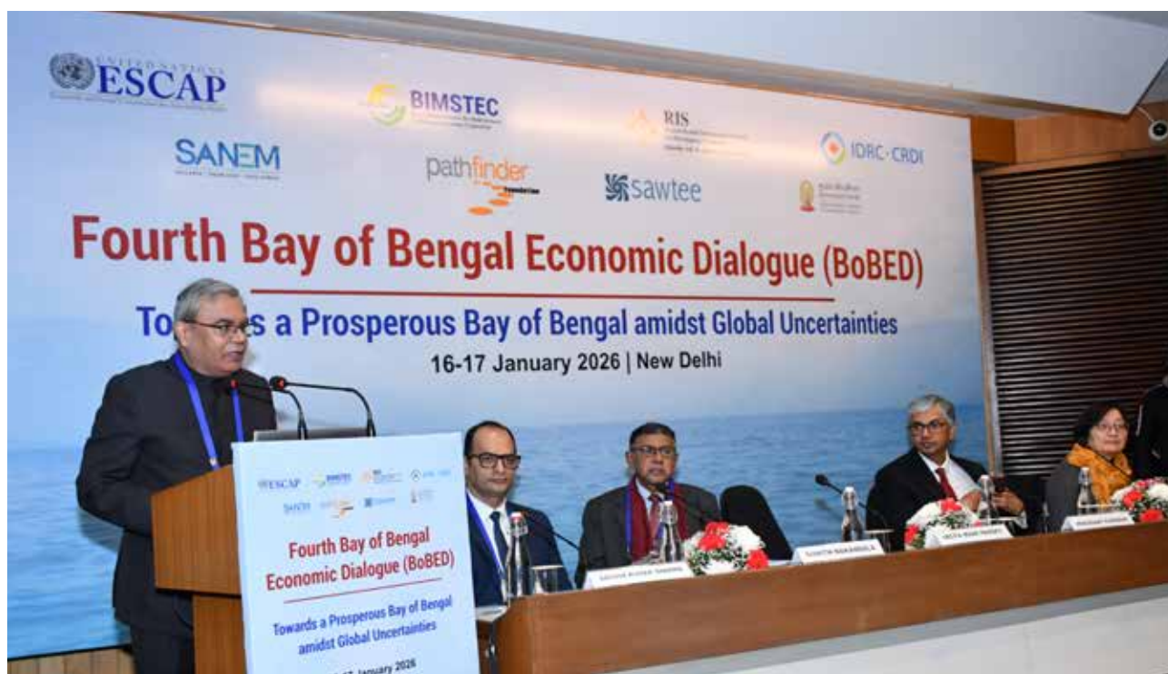
Inaugural Session of the Fourth Bay of Bengal Economic Dialogue.