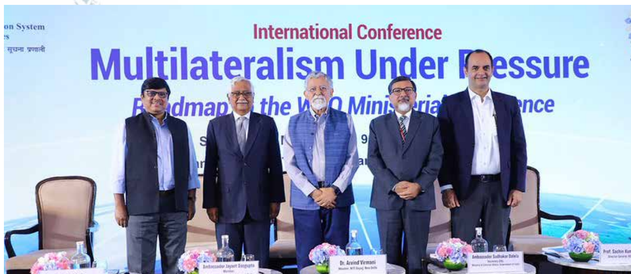
Inaugural Session at international conference on 'Multilateralism Under Pressure - Roadmap to the WTO Ministerial Conference' on 21st March 2026 at Taj Mahal, New Delhi.

Research and Information System for Developing Countries, RIS, organised a major international conference titled “Multilateralism Under Pressure: Roadmap to the WTO Ministerial Conference” on 21 March 2026 at Taj Mahal Palace Hotel to launch the RIS World Trade and Development Report 2026 (WTDR 2026). The conference brought together policymakers, diplomats, trade experts, academics, researchers, and students to deliberate on the future of the multilateral trading system ahead of the WTO’s 14th Ministerial Conference (MC14) in Cameroon.