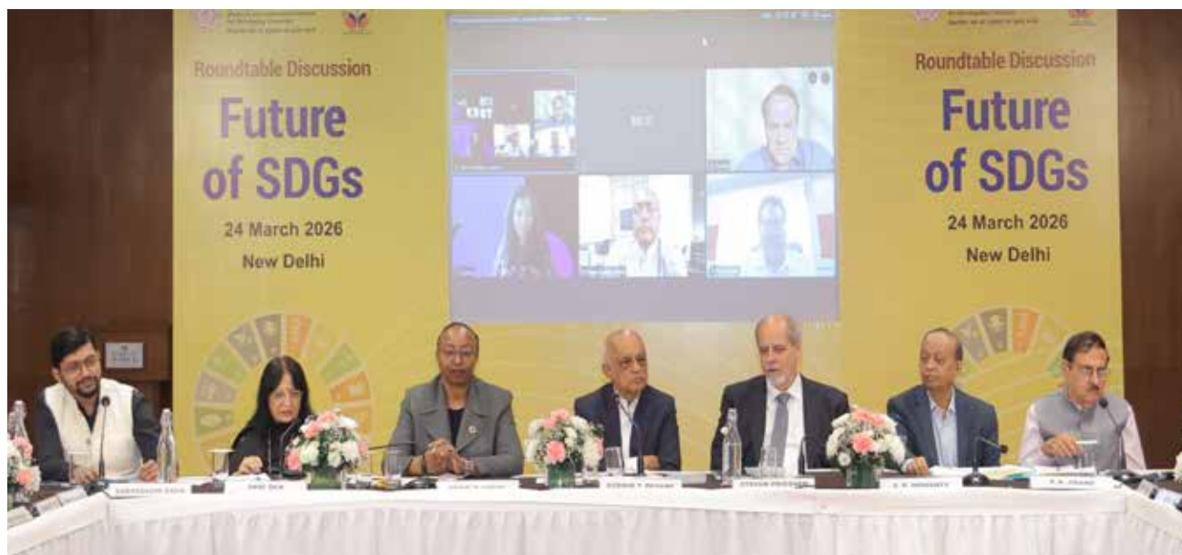
RIS hosted a Roundtable Discussion on "Future of SDGs".

DAKSHIN – Global South Centre of Excellence, at RIS organised the second Roundtable Discussion on "Future of SDGs" on 24 March 2026, continuing RIS's engagement on sustainable development pathways and their implications for India and the Global South. The roundtable brought together policymakers, scholars, and development practitioners to deliberate on localization efforts, national policies, and future trajectories of the Sustainable Development Goals (SDGs).