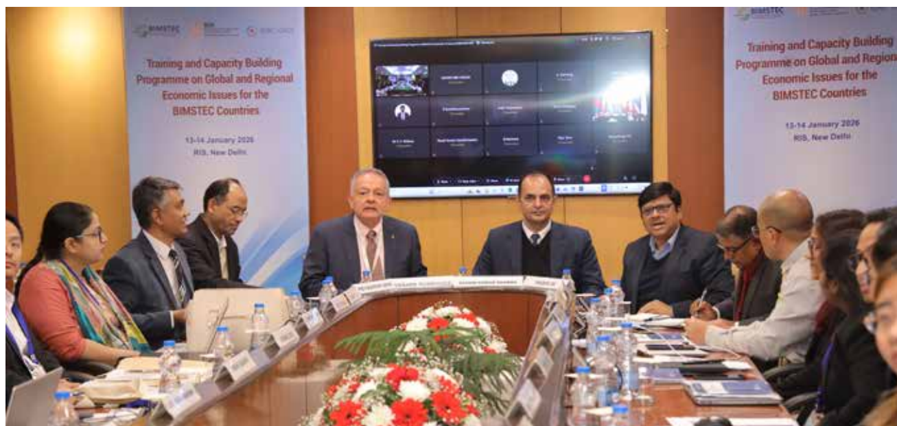
Training & Capacity Building Programme for BIMSTEC Countries.

Research and Information System for Developing Countries (RIS) in collaboration with BIMSTEC Secretariat and IDRC conducted two-day training programme on 13-14 January 2026 for BIMSTEC members on Global and Regional Economic Issues for BIMSTEC