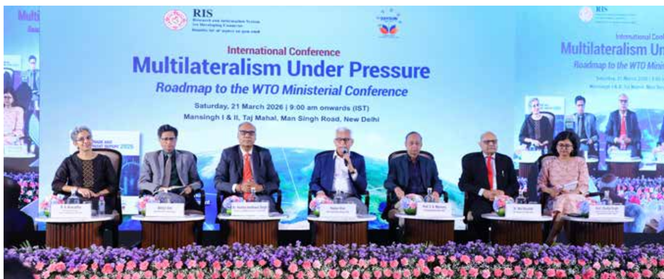
Session I on Broader Issues at the 14th WTO MC at conference on 'Multilateralism Under Pressure - Roadmap to the WTO Ministerial Conference' .