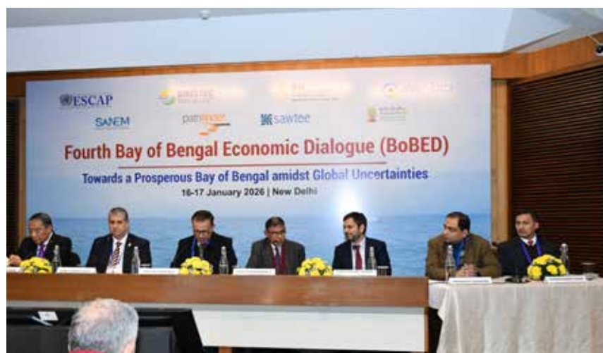
Panelists of the Fourth Bay of Bengal Economic Dialogue (BoBED), held at the India Habitat Centre (IHC), New Delhi.