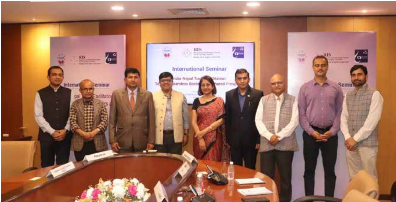
India–Nepal Trade Facilitation: Towards Seamless Borders and Shared Prosperity on 20th February 2026 at the RIS Conference Room, New Delhi.

Research and Information System for Developing Countries, in partnership with Neeti Anusandhan Pratishthan and the Eastern Himalayas Socio Cultural and Educational Foundation, organised an international seminar on “India–Nepal Trade Facilitation: Towards Seamless Borders and Shared Prosperity” on 20 February 2026 in New Delhi. The seminar brought together policymakers, researchers, and trade experts to discuss measures for improving bilateral trade efficiency and strengthening economic cooperation between India and Nepal.