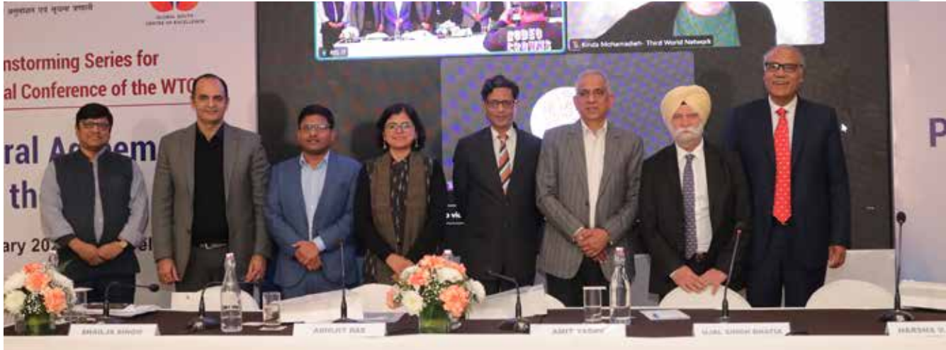
Panellists obliging the shutterbugs after the Brainstorming session on 'Plurilateral Agreements at the WTO'.

As part of the RIS Brainstorming Series in the lead-up to the 14th WTO Ministerial Conference (MC14), Research and Information System for Developing Countries organised a roundtable discussion on “Plurilateral Agreements at the WTO” on 22 January 2026. The discussion brought together policymakers, former negotiators, academics, and trade experts to examine the growing role of plurilateral initiatives and Joint Statement Initiatives (JSIs) within the WTO framework and their implications for multilateralism, development priorities, and institutional governance.