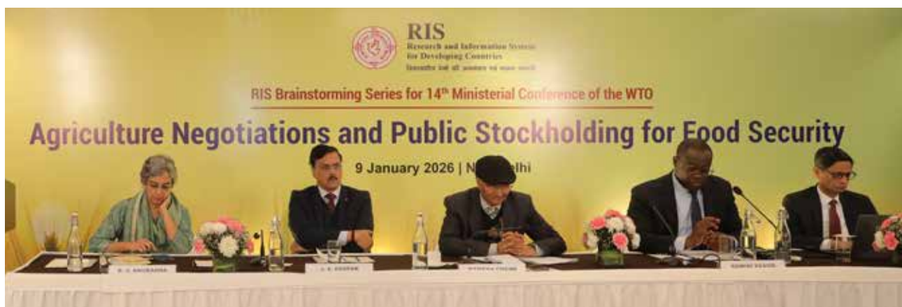
Agriculture Negotiations and Public Stockholding for Food Security.

RIS organised the second Brainstorming Series on "Agriculture Negotiations and Public Stockholding for Food Security" on 9 January 2026 ahead of the 14th WTO Ministerial Conference (MC14). The discussion brought together policymakers, trade negotiators, WTO experts, and researchers to deliberate on the future of WTO agriculture negotiations.