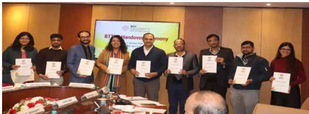
Launch of the IEPA’S Report during Handover Ceremony of BTTNF.