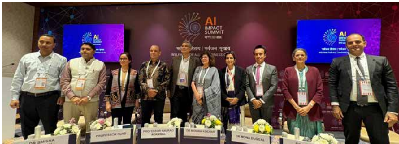
India AI Impact Summit 2026: RIS Panel Discussion on 'Workforce Readiness for Artificial Intelligence in Primary Health Care' at Bharat Mandapam.

DAKSHIN – Global South Centre of Excellence at RIS, in partnership with ICMR-National Institute for Research in Digital Health and Data Science and Johns Hopkins University, convened a panel discussion on “Workforce Readiness for Artificial Intelligence in Primary Health Care” on 18 February 2026 at Bharat Mandapam. The discussion examined how health systems, academic institutions, governments, and innovation ecosystems must adapt to AI-driven transformation in primary healthcare.