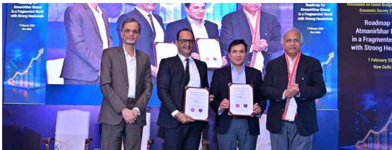
Discussion on Union Budget 2026-27 and Economic Survey 2025-26 'Roadmap for Atmanirbhar Bharat in a Fragmented World with Strong Headwinds'

observed that the fragmented global environment presents both opportunities and risks for India. While high public capital expenditure remains necessary due to infrastructure gaps and weak private investment, manufacturing continues to remain a weak link despite its employment potential. He highlighted that