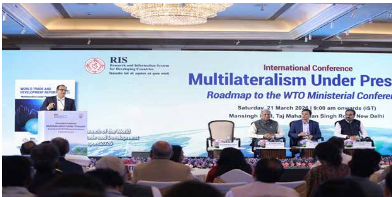
Valedictory Session at the International Conference on 'Multilateralism Under Pressure - Roadmap to the WTO Ministerial Conference'

space, and digital inequality for developing countries. Dr. Pritam Banerjee argued that rigid industrial policy disciplines risk limiting development opportunities for late industrialisers such as India.