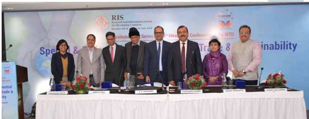
Fifth Brainstorming Series, Session I 'Special and Differential Treatment' on 9th February 2026 at Tamarind Hall, India Habitat Centre, New Delhi.

As part of its Brainstorming Series ahead of the 14th WTO Ministerial Conference (MC14), Research and Information System for Developing Countries organised discussions on 'Special and Differential Treatment (S&DT)' and 'Trade and Sustainability,' 9th February 2026.