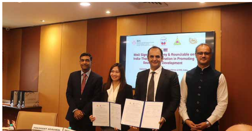
MoU Signing Ceremony between DAKSHIN (at RIS) and Ubon Ratchathani University

Discussions during the event highlighted the importance of ensuring that institutional partnerships lead to tangible outcomes through sustained