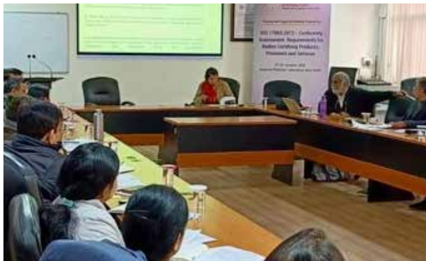
Training Programme: ISO/IEC 17065:2012: Conformity Assessment -Requirements for Bodies Certifying Products, Processes and Services being conducted.

The training was organised in the context of NPL’s role as India’s national verification agency for certification of instruments and equipment used in monitoring emissions and ambient air quality under the Environment (Protection) Act, 1986. The sessions focused on