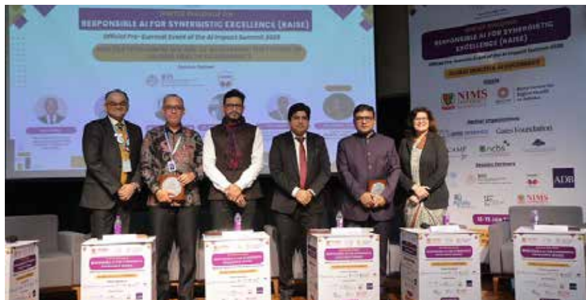
Panelists at the ‘Multilateralism in the Age of AI: Shaping the Future of Global Health Governance’.