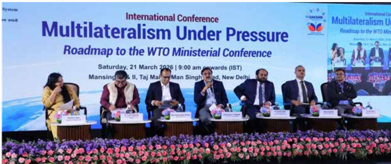
Session II on Specific Issues at the 14th WTO MC at the conference on ‘Multilateralism Under Pressure - Roadmap to the WTO Ministerial Conference’ on 21st March 2026 at Taj Mahal, New Delhi.