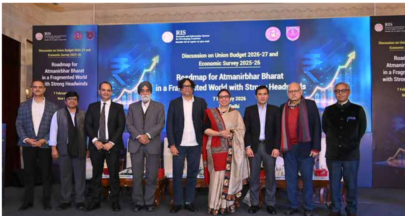
Panellists during Discussion on Union Budget 2026-27 and Economic Survey 2025-26 'Roadmap for Atmanirbhar Bharat in a Fragmented World with Strong Headwinds'.

customs duty rationalisation and MSME support are positive measures but emphasised the need for stronger reforms related to pollution management, strategic disinvestment, capital attraction, and market distortions.