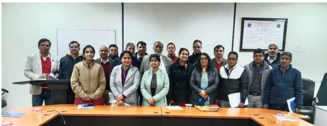
Capturing a moment of learning and excellence during the training programme.

strengthening institutional capacity in certification scheme design, governance, and accreditation-ready processes amid evolving regulatory requirements. The technical sessions covered the core requirements of ISO/IEC 17065, including legal responsibility,