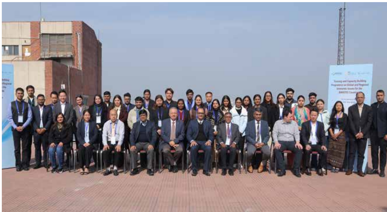
Training & Capacity Building Programme for BIMSTEC Countries, 13-14 January 2026