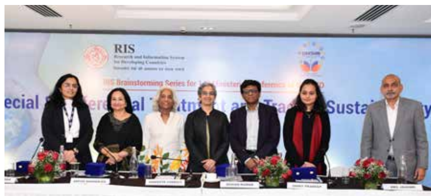
Panel posing for a group photograph post session.