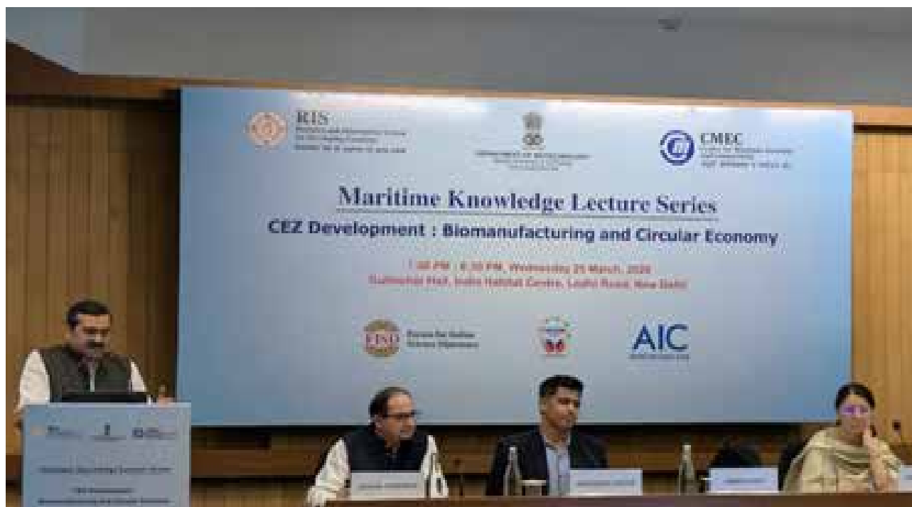
CMEC and FICD at RIS co-hosted, 15th Maritime Knowledge Lecture Series on “CEZ Development, Biomanufacturing and Circular Economy”.

CMEC and the Forum for Indian Science Diplomacy, policy limbs of RIS, organised the 15th Maritime Knowledge Lecture Series on “CEZ Development, Biomanufacturing and Circular economy,” with knowledge support from the Department of Biotechnology, Government of India. The session examined the role of biomanufacturing and circular economy in shaping the next phase of India’s coastal industrial development under the broader framework of Maritime Amritkaal Vision 2047.