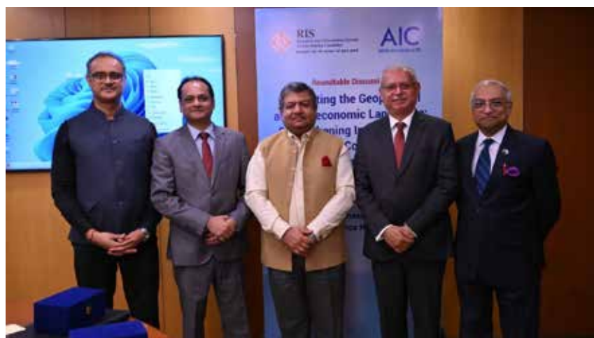
Roundtable Discussion on ‘Navigating the Geopolitical and Geoeconomic Landscape: Strengthening India-ASEAN Maritime Cooperation in a Changing World’.