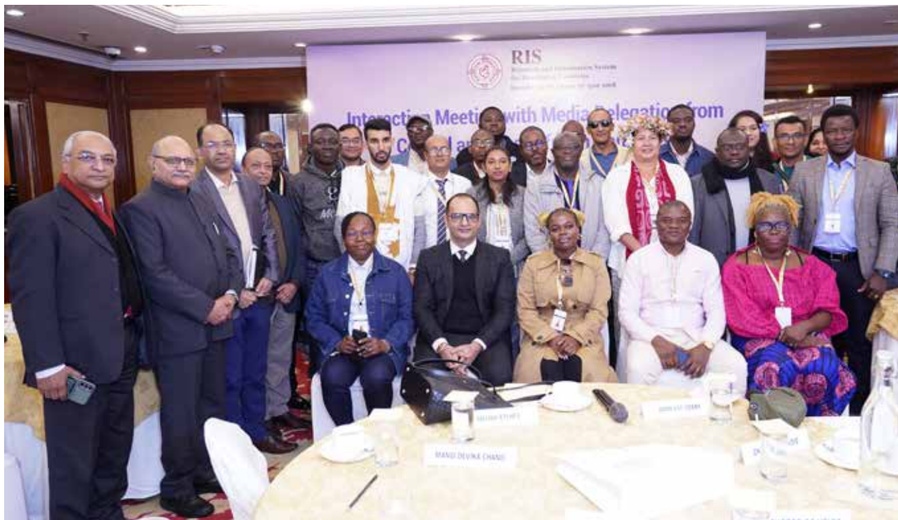
Media Delegation from Central and West Africa at RIS for Deliberations on South-South Cooperation.

On 14th January 2026, RIS hosted a media delegation from Central and West African countries as part of its ongoing engagement with partners from the Global South.