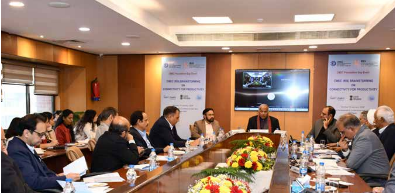
Proceedings at the Panel Discussion on 'Connectivity for Productivity: Ports as Production Engines'.

Centre for Maritime Economy and Connectivity (CMEC), at RIS, marked its Foundation Day with a high-level panel discussion on “Connectivity for Productivity: Ports as Production Engines” on 19 January 2026. The discussion focused on leveraging the PM GatiShakti National Master Plan to strengthen multimodal logistics integration, coastal shipping, and inland waterways connectivity.