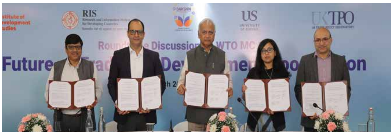
Signing of the MoU between RIS and IDS, the University of Sussex, and UKTPO during the roundtable discussions on 'WTO MC14 Future of Trade and Development Cooperation'.

RIS in collaboration with the UK Trade Policy Observatory (UK TPO), and the University of Sussex, convened a Roundtable Discussion on the 'WTO MC14 Future of Trade and Development Cooperation' on 18 March 2026 at Tamarind Hall, IHC, New Delhi. The discussion was structured in two sessions along with an inaugural session.