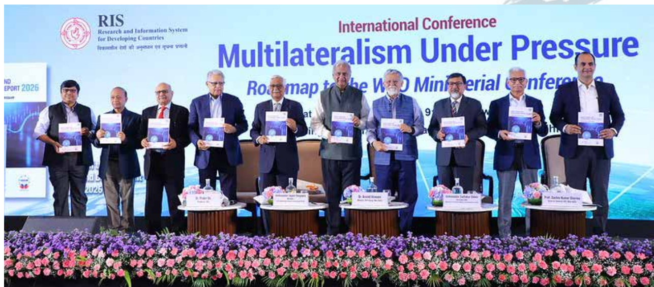
Launch of RIS World Trade and Development Report (WTDR) 2026 at International Conference on 'Multilateralism Under Pressure: Roadmap to the WTO Ministerial Conference' .