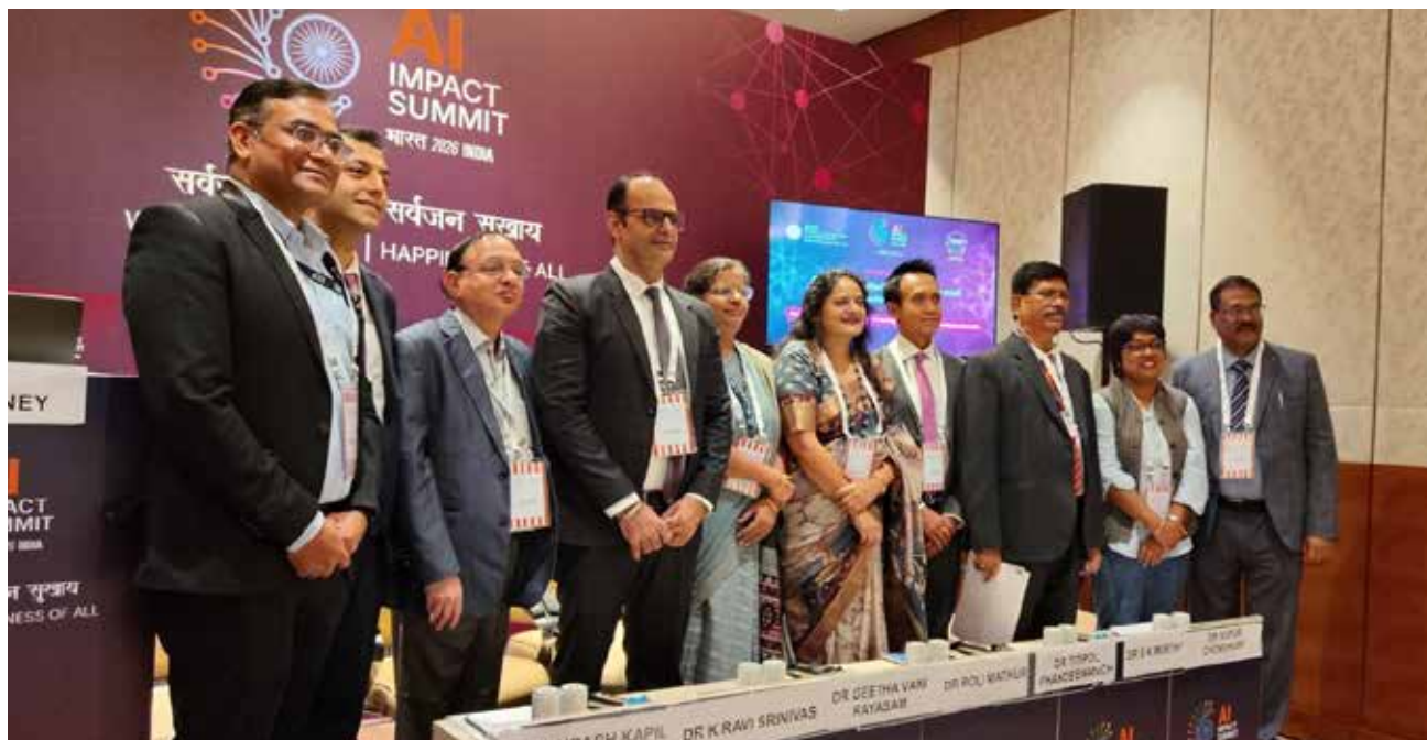
Panel Discussion on 'Safe and Trusted AI: The Ethics and Governance Perspective' held on 18th February 2026 at Bharat Mandapam, New Delhi.

As Knowledge Partner of the India AI Impact Summit 2026, Research and Information System for Developing Countries organised a panel discussion on “Safe and Trusted AI: The Ethics and Governance Perspective” on 18 February 2026 at Bharat Mandapam. The session brought together experts from government, academia, research, and industry to deliberate on ethical safeguards, accountability, and governance frameworks for safe and trustworthy AI systems.